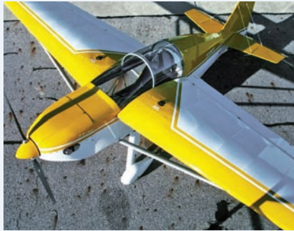
RANS S-9 Chaos

RANS Aircraft discontinued the S-9 Chaos and S-10 Sakota more than a year ago, but they're back, due to customer requests. RANS will begin delivery of the one- and two-place aerobatic kit planes in June. For more information, visit www.RANS.com or call 785-625-6346.