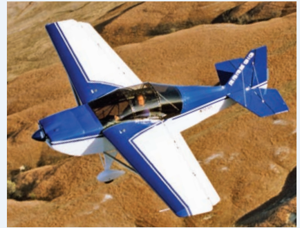
RANS S-10 Sakota